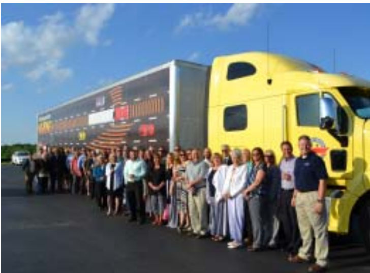
Tennessee Trucking Association's "No Zone" trailer and guest attending the Transportation Professional of the Year Dinner.